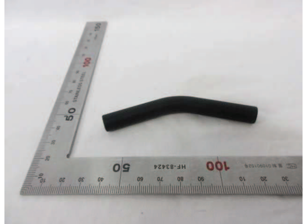
Sample No. 2