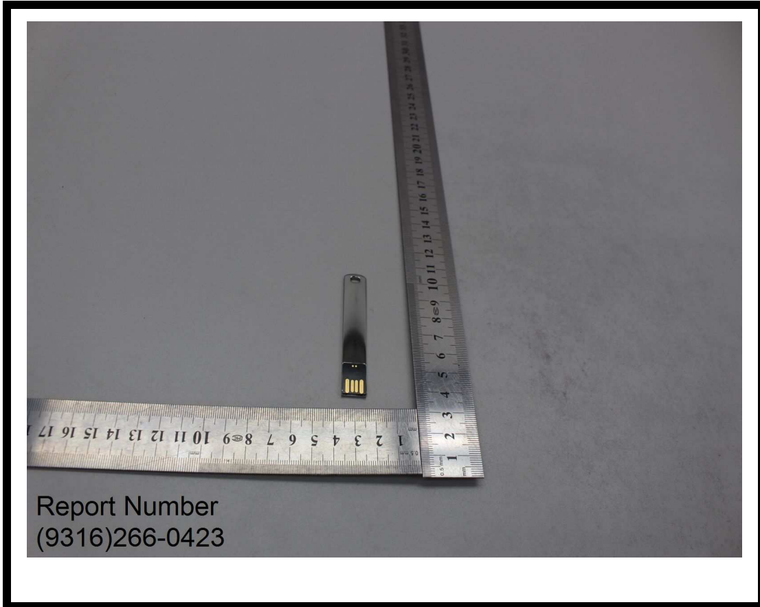
Photo of the Submitted Sample

LAB NO. : (9316)266-0423 DATE : Sep 28, 2016 PAGE : 3 OF 16